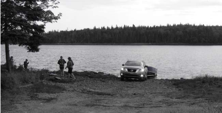
Boat launch at the end of Church Point

This launch site is at the end of the point that divides Sheet Harbour giving ready access to both sides.