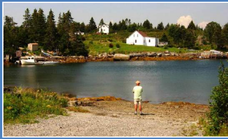
Wide gravel ramp at Ecum Secum West

This quaint little cove is near the entrance to Ecum Secum Harbour. A couple of Crown islands are not far past the entrance. A paddle up harbour (about 2km) is another option. For detailed route information, see "Eastern Shore, Ecum Secum" in Scott Cunningham's excellent book Sea Kayaking in Nova Scotia (revised 2013).