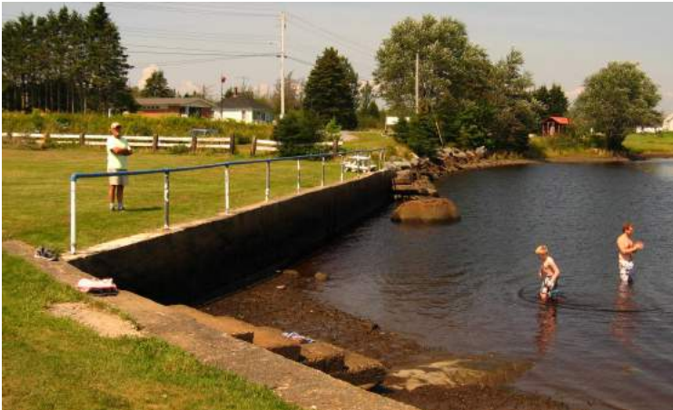
Moser River Seaside Park and water access

This park is in the small village of Moser River at the head of Necum Teuch Harbour about 2 km from the open sea.