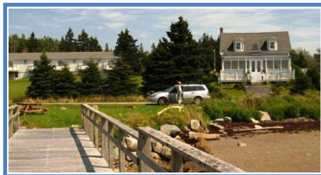
Wharf and beach in front of motel