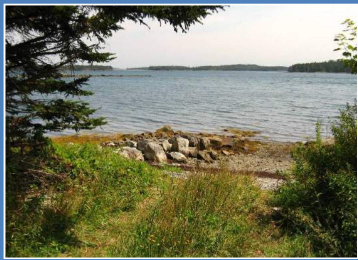
Beaver Harbour ramp at head of MacLeods Cove.

This ramp gives access to dramatic Big Rocky Island and other islands in Beaver Harbour. See Google Earth.