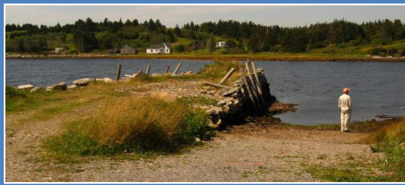
Ramp and old wharf at Port Dufferin

This ramp allows easy access into the head of the cove and the islands of Beaver Harbour and beyond. The Marquis of Dufferin Motel, directly across the road, makes an ideal base for touring. Guests can also use the small beach in front of the motel. For detailed route information, see "Eastern Shore, Port Dufferin" in Scott Cunningham's excellent book Sea Kayaking in Nova Scotia (revised 2013).