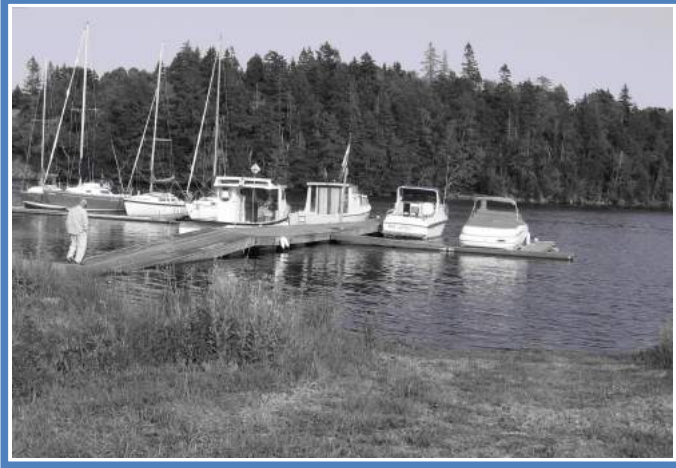
The marina ramp next to the road

This little marina, Marlis Landing, has a small roadside ramp. From here you can paddle up the tidal East River for two kms or out the harbour. There is also water access across the river by the bridge. (See "Sheet Harbour- Bridge").