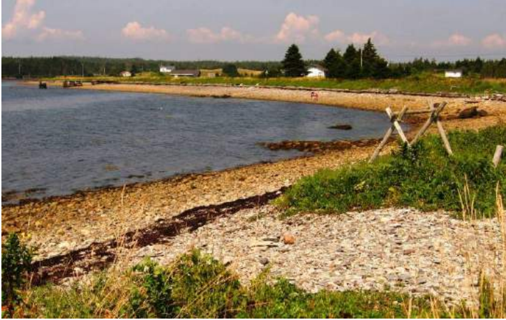
Curved cobble beach at Smith Cove

This is a scenic cove with a few homes spread along the road. Like most many launch sites along the Eastern Shore, wilderness shores and off-shore islands are not far away.