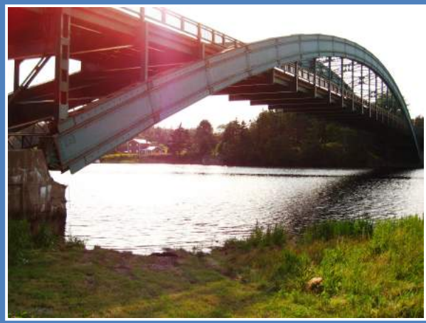
Water access beside bridge

This launch has grassy areas for unloading and off road parking. From here you can paddle up the tidal East River for two kms or out the harbour.