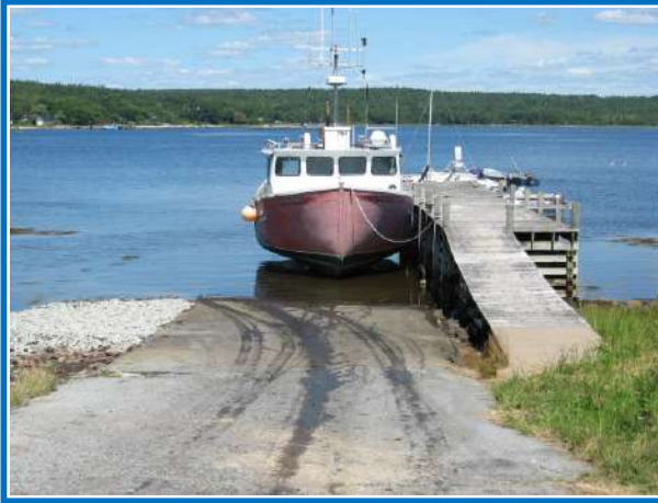
Ramp near wharf at Central Port Mouton

This community (pronounced Port Ma-Tune) is a busy fishing port with a large breakwater and fish plant. The protected ramp is a good site to launch into Port Mouton Bay to explore the islands and beaches. For a good map and route details, see the PDF of Paddle Lunenburg-Queens (Page 41-43, Port Mouton) at the NS Coastal Water Trails home page.