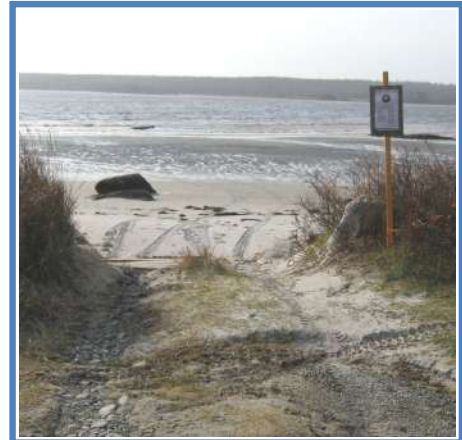
Durham Lane launch site

This launch site known locally as Port Joli Beach is near the head of sheltered Port Joli Harbour with its shallow waters and sandy bottom. This is an area of migrating geese and sea birds. Fine sand beaches ring much of this harbour. From here you could paddle over to explore Thomas Raddall Park (see Launch Site). For a good map and route details, see the PDF of Paddle Lunenburg-Queens (Page 36-38, Port Joli) at the NS Coastal Water Trails home page.