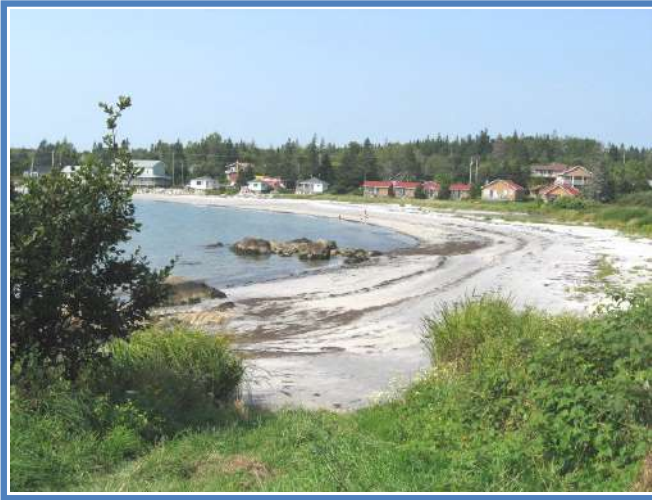
Path to beach with waterfront cottages

This pretty, sheltered cove has a fine sand beach that curves along the head of the harbour. Access is from a path at one end.