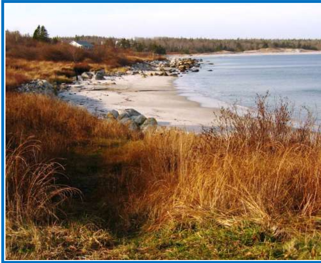
White sand beach at old wharf site.

This lovely launch site gives access to Port Mouton Island and the Spectacle Islands or to a longer trip to the Kejimikujik Seaside Park. For good maps and route details, see the PDF of Paddle Lunenburg-Queens (Page 39-43, Port Mouton and Kejimikujik Seaside ) at the NS Coastal Water Trails home page. Note: Popular Carter's Beach is a short paddle NW and worth a visit but not listed as a launch site as parking can be crowded and it is a longer carry.