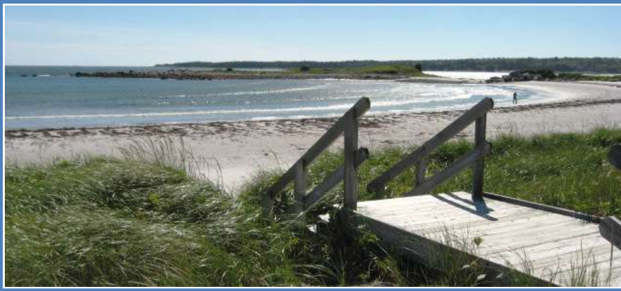
Day use beach

This large wooded provincial park has a day use area, campground, hiking trails, over 3 km of shoreline and lovely beaches. As a stopover on a longer trip, this is an ideal spot to have lunch and stretch your legs. This is also a fine place to camp if you want some amenities on your paddling trip. However it is a long carry (300m to 600 m) from the day use area or campground to the shore. If you just need a place to launch, the two launch sites across the harbour have much shorter carries. For a good map and route details, see the PDF of Paddle Lunenburg-Queens (Page 36-38, Port Joli) at the Nova Scotia Coastal Water Trails home page.