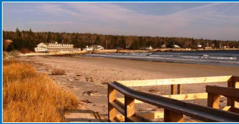
The north end of Summerville Beach looking toward the Quarterdeck on a light surf day.

This provincial park has a wide hard sand beach about 1 km long. It is not an ideal launch site as it is exposed and surfy. It also has a long carry on the board walk with sharp turns at the end (not easy with a 17 foot kayak). It is a good stopover if you need to stretch, use the washroom or have lunch at the Quarterdeck.