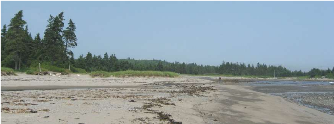
The beach at Gull Bay.

This is a wooded and undeveloped shoreline of beaches, streams, paths and fragile sand dunes.