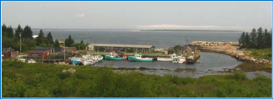
Moose Harbour with Coffin Island in the distant mist.

This small scenic protected harbour is at the entrance to Liverpool Bay.