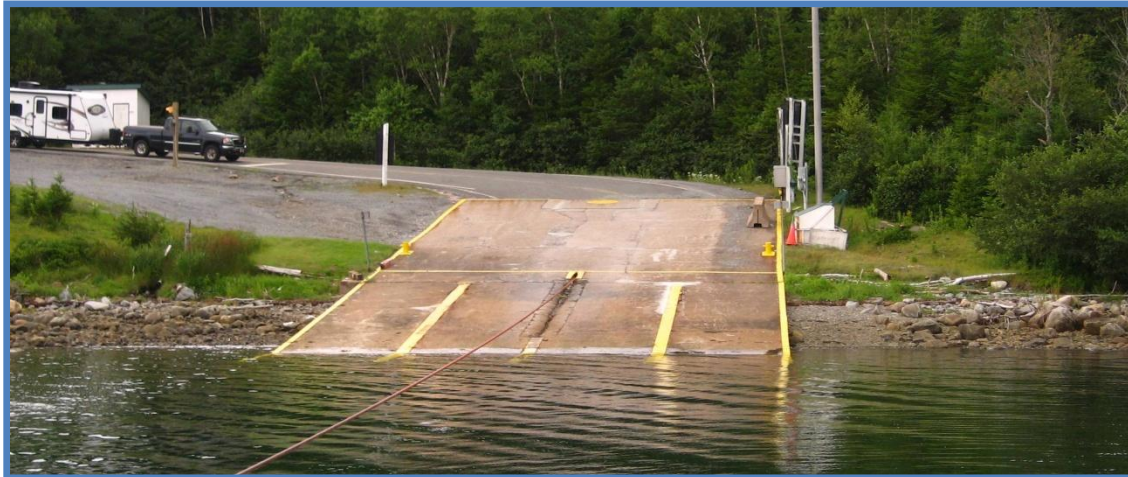
Country Harbour Ferry Ramp - West side

Country Harbour is a 15 km long harbour that invites exploring up a treed wilderness. The ferry is 2 km up harbour and crosses every half hour. A scenic provincial campground is about 10 km up harbour from the ferry making for a paddle destination. ( See Salsman Provincial Park launch site).