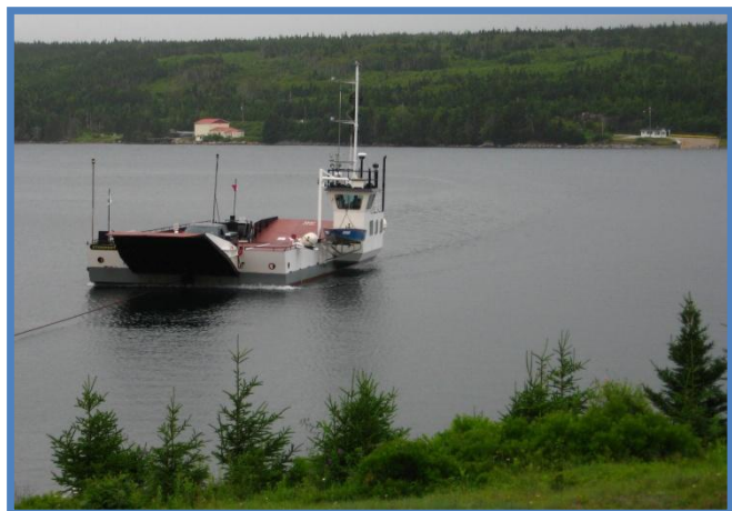
Country Harbour Ferry

NEARBY SERVICES Sherbrooke - Full range of services. Small store in Port Bickerton.