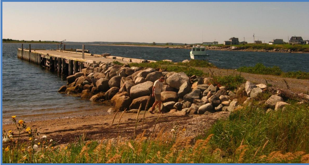
Charlos Cove wharf and launch site

This pretty cove is protected from the SW winds and has small islands to explore nearby.