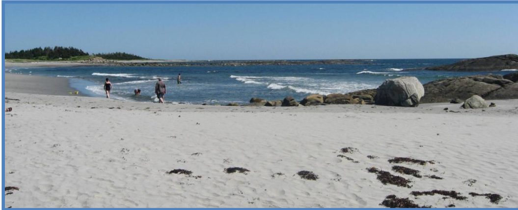
A summer day at Tor Bay Beach.

The magnificent beaches at Tor Bay are divided by a headland and a lagoon. Boardwalks and trails lead from the parking lot to the beaches. The eastern beach is the shorter distance to transport a boat but still a 70 m carry. It would also be a good spot to land and relax or go for a walk if paddling by. No other public launch sites were found in the community of Tor Bay but there is one in nearby Larry's River ( see Launch Site listing)