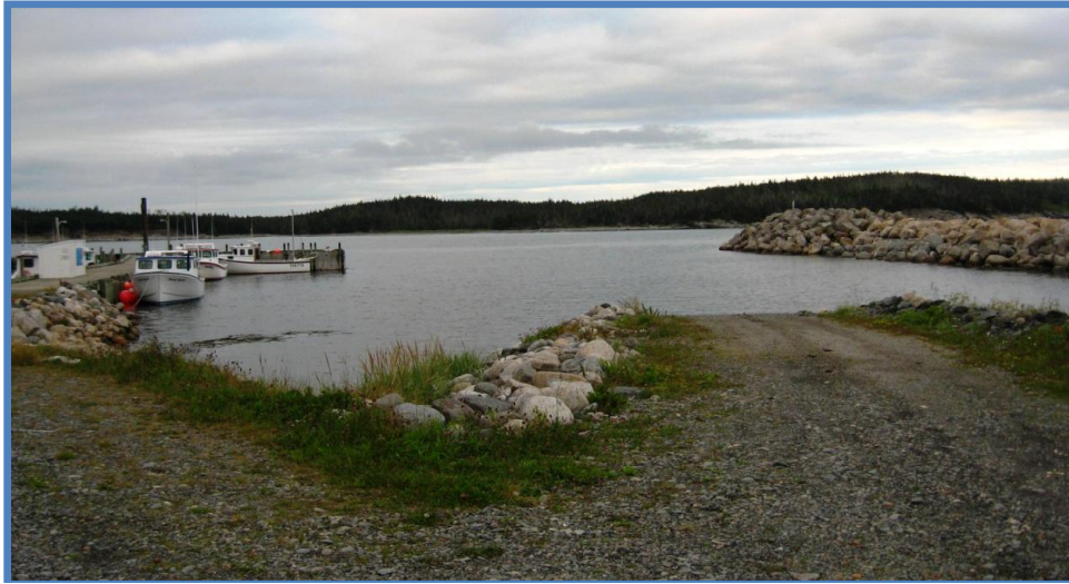
New Harbour wharf, ramp and breakwater

This small harbour has a lovely sand beach within it. Exposed once outside.