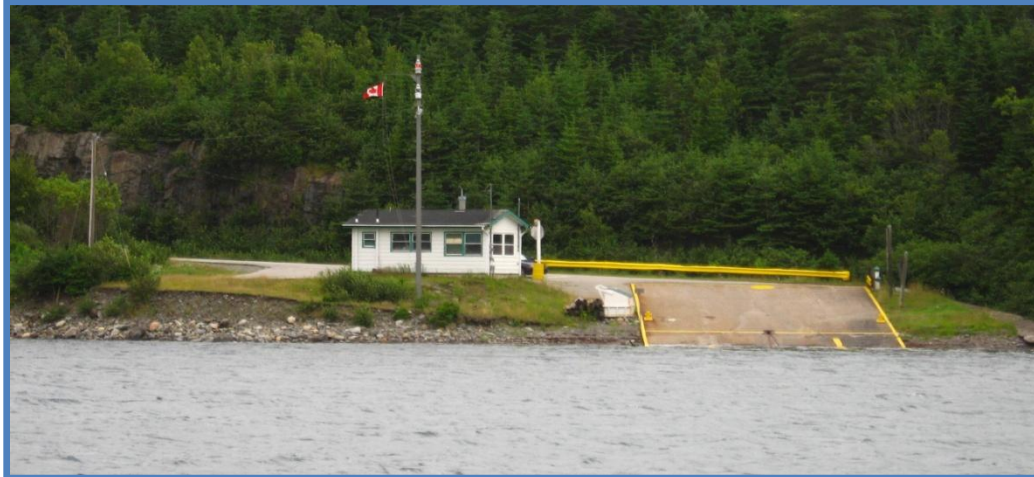
Country Harbour Ferry Ramp - East Side

Country Harbour is a 15 km long harbour that invites exploring up a treed wilderness. The ferry is 2 km up harbour and crosses every half hour. A scenic provincial campground is about 10 km up harbour from the ferry making for a paddle destination. (See Salsman Provincial Park launch site). According to ferry staff, the harbour can get windy but currents are not strong.