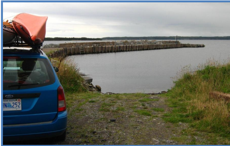
Drum Head ramp and breakwater

Drum Head is a good launch site to reach two large islands not far offshore. The small harbour is protected but it is open ocean once you leave. For detailed route information, see "Eastern Shore, Country Harbour" Sea Kayaking in Nova Scotia by Scott Cunningham (revised 2013).