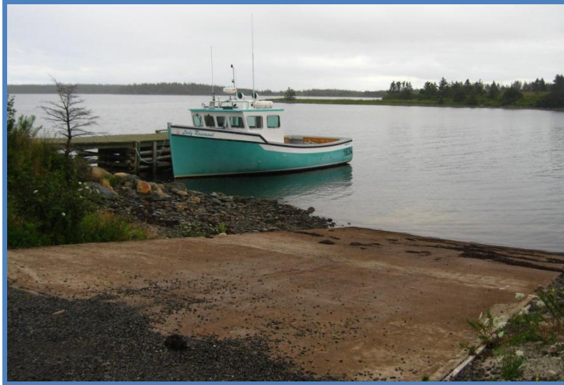
Coddles Harbour Ramp

Coddles Harbour like its name is a cute little place with a few houses, wharfs and large pond. It is a good launch site to reach a small island about 1 km offshore. The harbour is protected but it is open ocean once you get past the island. For detailed route information, see "Eastern Shore, Country Harbour" Sea Kayaking in Nova Scotia by Scott Cunningham (revised 2013).