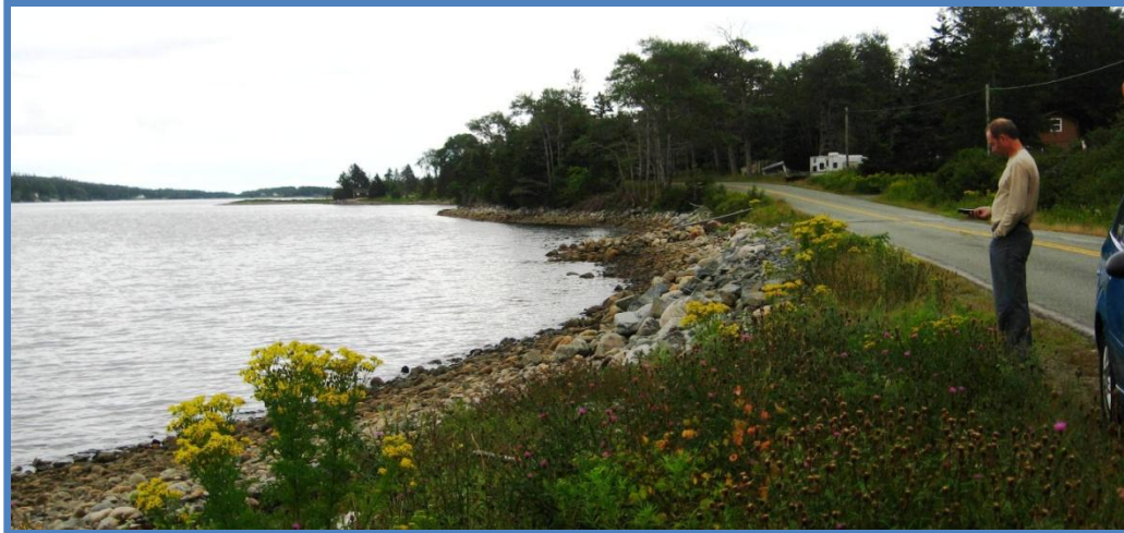
Shoreline access on Isaac's Harbour

This is not an ideal launch site but the only one found on the west side of the harbour. A better one is on the east side at Goldboro Marine Park. ( See description.) You can paddle within this narrow 4 km harbour or venture to some large off shore islands. For detailed route information, see "Eastern Shore, Country Harbour" Sea Kayaking in Nova Scotia by Scott Cunningham (revised 2013).