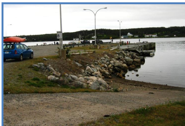
Goldboro Marina wharf and ramp

Arriving by sea Look for a large square wharf and small new building on the east side of the harbour. Ramp is just past the wharf.