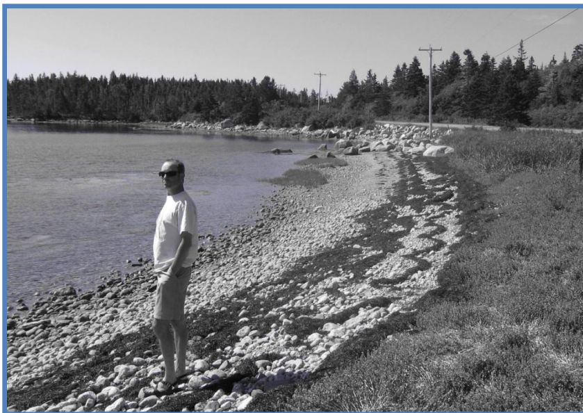
Shoreline at English Cove

This lovely wooded cove is about 2.5 km east of Charlos Cove and lined with little beaches. From here you catch a distant view of the Sugar Islands group. Paddle to the sand beach at the next cove to the east. No launch sites were found in Cole Harbour.