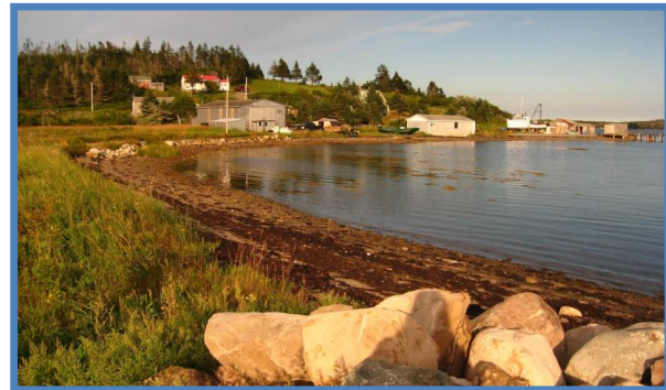
Shoreline launch on east end of the canal.

Arriving by land Turn off Route 316 to Whitehead and go about 1km. Turn off a dirt road on your left just before the canal. Note: The launch area just south of the canal is private.