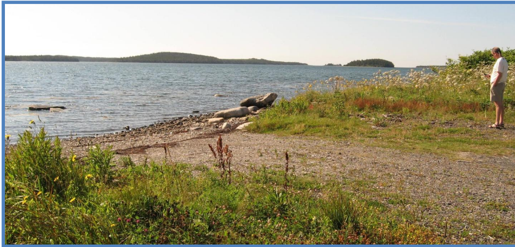
Gravel road access at Port Felix

This is a fine area for paddling with a group of islands nearby and the Sugar Islands group about 3 km offshore. For detailed route information, see "Eastern Shore, The Sugar Islands" Sea Kayaking in Nova Scotia by Scott Cunningham (revised 2013).