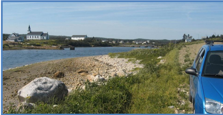
Looking up the inlet to the village.

This is a small Acadian community with a big sense of heritage. The roadside display depicting the Acadian story is well worth a visit. Also the flag festooned foot bridge across the inlet. The busy government wharf area has no ramp but there is shoreline access suitable for small boats on the opposite side of the inlet.