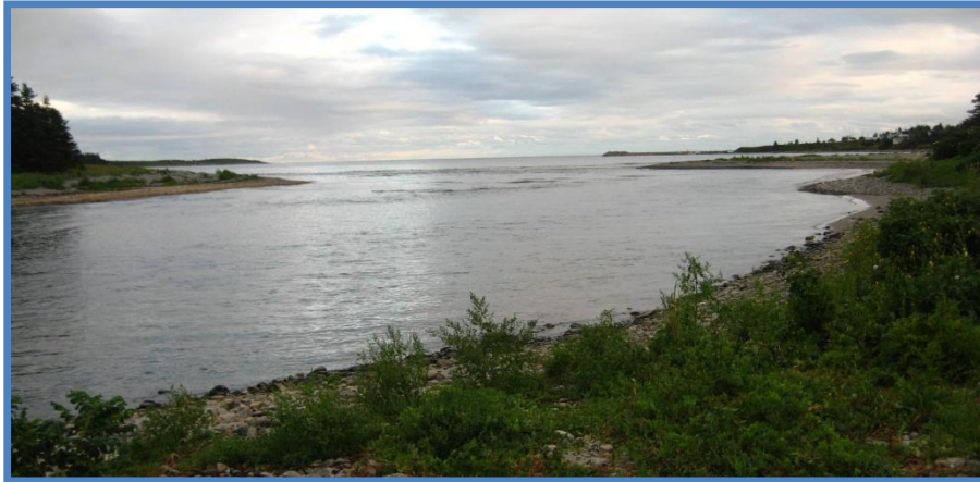
River mouth at New Harbour

A lovely sand beach stretches along the shore at the entrance to this river. It may be possible to paddle under the bridge with the incoming tide and explore New Harbour River which is more like a long narrow lake ( 6 km).