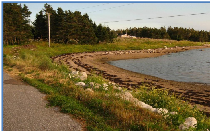
Roadside beach launch

This launch site is close to the inviting islands at the entrance to the harbour. This site would also be handy if you needed an emergency exit with road access in this area.