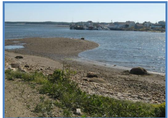
Shoreline access at the inlet entrance