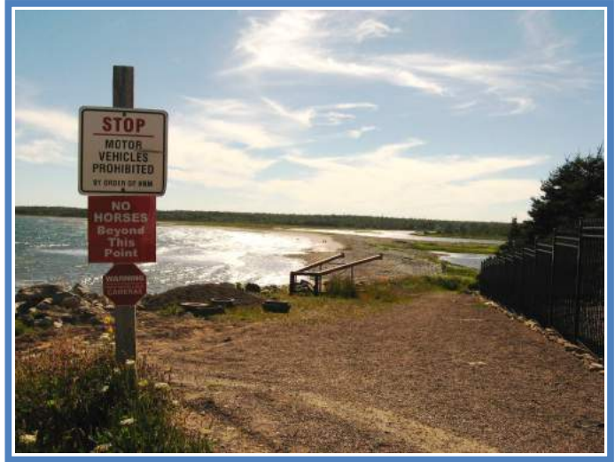
Trail to Cow Bay Beach

Fine gravel path to beach. About 60m carry. Cobble/sand beach.