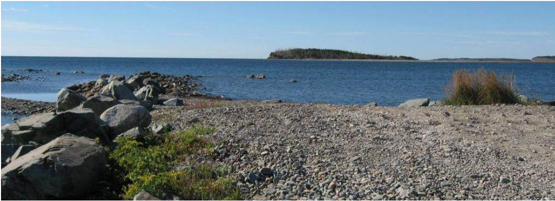
Gravel ramp at mouth of Chezzetcook Inlet

This launch site is at the end of a peninsula and faces the open Atlantic. A couple nearby drumlin islands that are Crown land could be paddling destinations on a calm day. Or you could paddle around to Long Beach to the east or up into Chezzetcook Inlet.