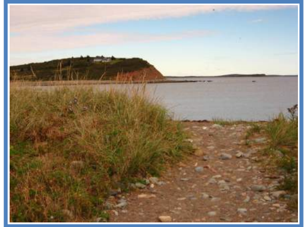
Path to beach

Across from entrance to Hope for Wildlife. 5909 Hwy 207. At south end of beach.