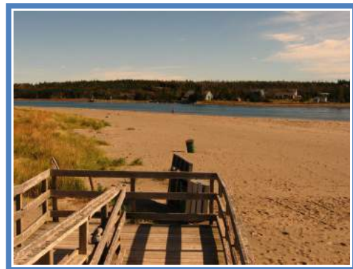
Looking from boardwalk ramp across the channel.

You can paddle out to sea and the beach from the launch site via a wide sandy channel. Watch for tidal currents in the channel. The beach can also be accessed via a long boardwalk and a 100 m carry.