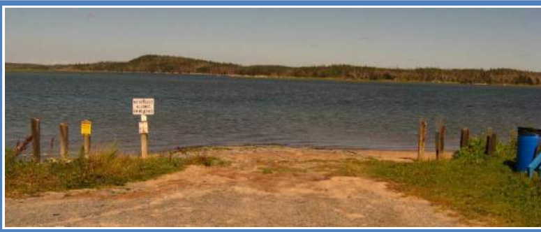
Boat launch at park into lagoon

This 3km long surfy sand beach has a huge tidal lagoon behind it with many paddling options. On a surfy day, launching will be easier into this shallow lagoon which is about 3 km long and 3 km wide. It has many channels to explore and exits to the harbour