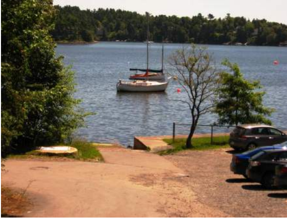
Lion's Park ramp