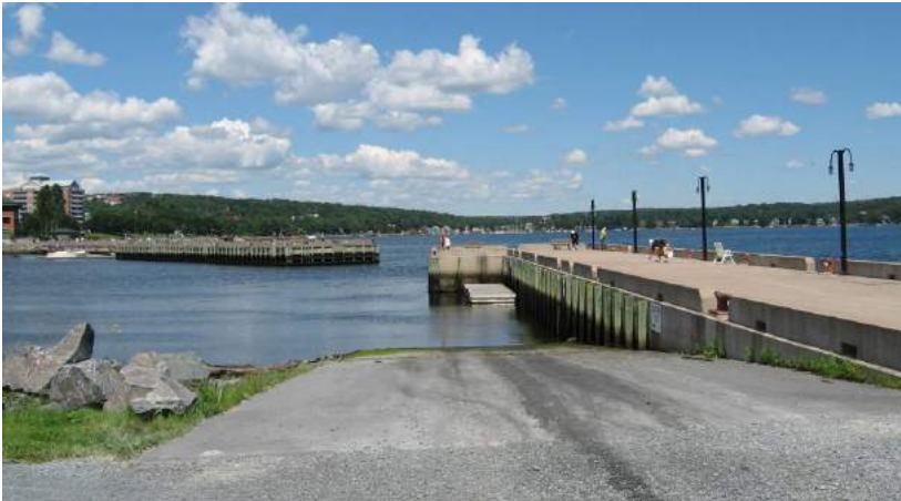
DeWolf Park ramp

From here you can paddle across to Admiral Cove Park (wooded area across Bedford Bay) and into Bedford Basin. Landing is limited around the Basin due to steep rock banks that support railway tracks, private property and DND land. A possible landing spot is a short paddle away at Bedford Lion's Park (see next site)