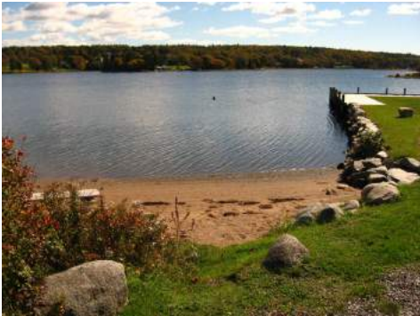
Park beach and launch site Park from the road