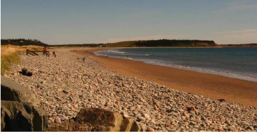
Lawrencetown Beach on a calm day

This is a popular beach with surfers. The surf can make for a challenging launch but on calm days it is OK. The park is gated at dusk but the first pullover to the west and the closest water access is before the gate. Note: Another beach west of here is signed for its dangerous currents.