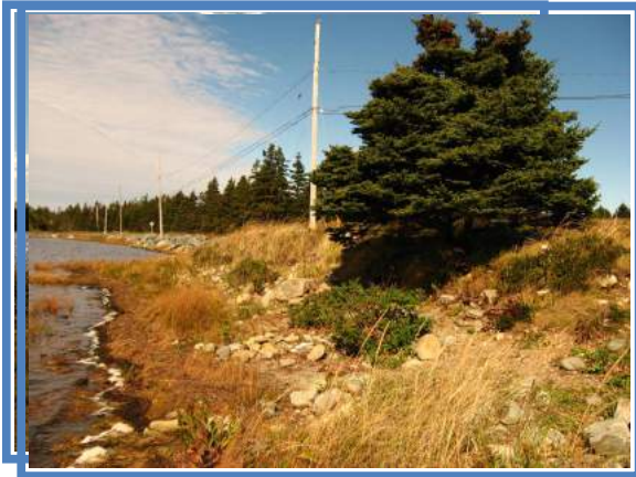
Parking area and trail to shore