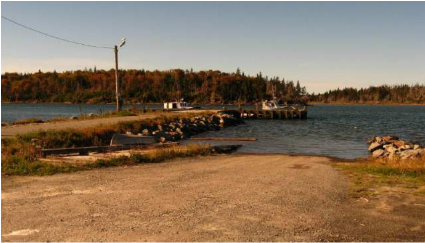
East Chezzetcook wharf and ramp

The wharf here is on one of the channels that remain in this shallow inlet at low tide. High tide may be a better time for exploring this area. The islands across from the wharf are Crown Land. Many of the spruce trees look grey, killed by insects.