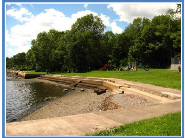
Lion's Park beach

This lovely little park with big hardwoods is a busy spot in summer with a swimming pool and playground. The lawn provides space to organize and pack gear or have a picnic. From here you could paddle over to Admiral Cove Park or out into Bedford Basin. The shoreline here is very developed with private homes.