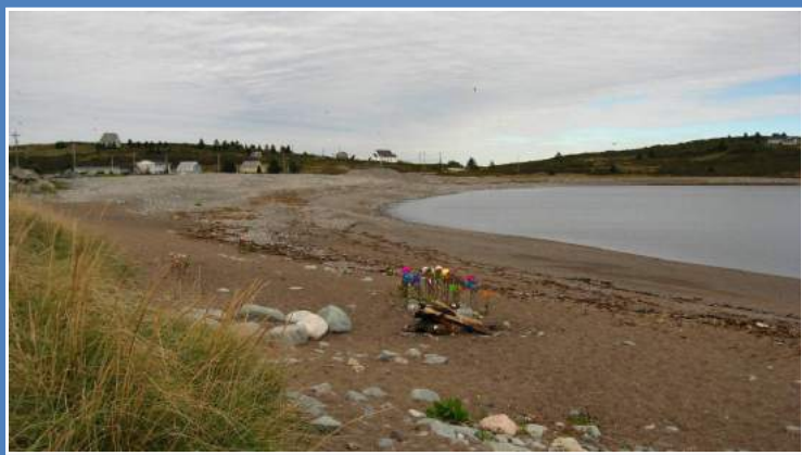
Seaforth Beach at low tide

This is a wide crescent beach that allows easier launching at low tide than the site at Causeway Rd.