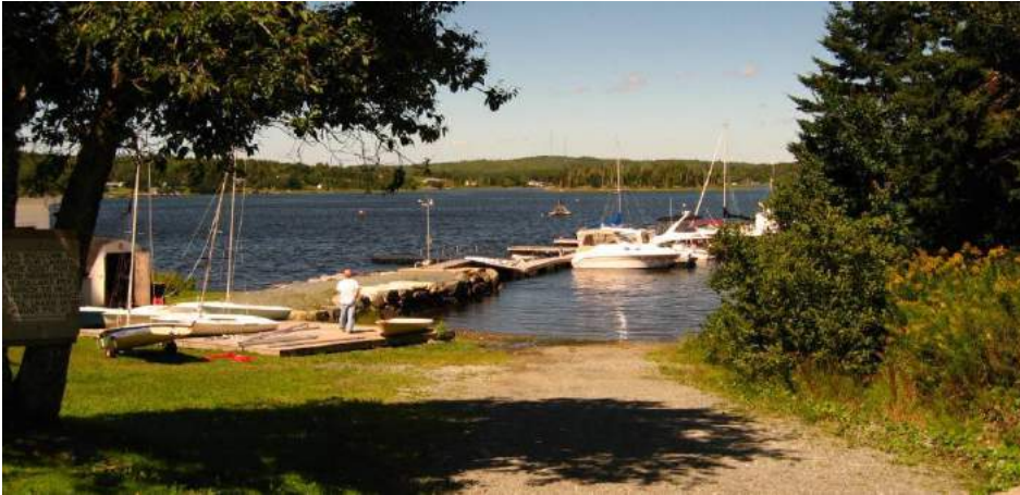
Petpeswick Yacht Club ramp

This is a welcoming spot with access to the upper Inlet which has many waterfront homes and a couple small islands. If you decide to paddle down the inlet, be aware of the tide direction and currents up to six knots at the narrows.