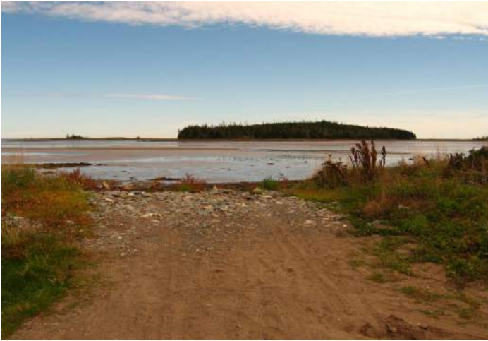
Causeway Beach at low tide

A sand cobble beach lines the causeway out to Fishermen's Reserve. The Reserve is a busy place of fish sheds and boats. The waters along this causeway are shallow, and bars and flats are exposed at low tide. This attracts lots of herons and other feeding birds. But you may want a somewhat higher tide to explore this area. Seaforth Beach up the road is not as shallow. (see next site)